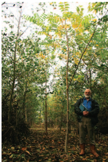
Hybrid walnut MJ209 at year 6, after thinning of the alder nurse.

The other hybrid tested was the clone IRTA X-80 that was